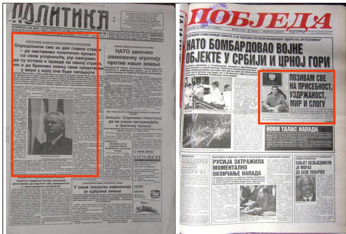
Figure 1. The first pages of Politika (left) and Pobjeda (right), the first day after the bombing started – 25 March 1999.

Politika relies on a prevalence of verbal text, with few black/white photos, no screamer headlines, and almost no framing of articles, whereas Pobjeda uses more photos, red color in its name, stronger framing around the articles and screamer headlines. Politika has mainly vertical page division, while Pobjeda prefers a horizontal divide. The positions of the addresses on the first pages also differ. Milošević's address is printed on the left side of the front page; it is foregrounded by occupying half of the page and by being presented in its entirety on the first page. The close-up photo of Milošević which accompanies the address both identifies the speaker and characterizes him. Identification is assured by the caption under the photo with Milošević's name and his title. That Milošević is characterized as serious and as being on official duty is signaled by his attire: suit and tie. Flags behind him symbolize him as a representative of the nation and they underline the official nature of the occasion.